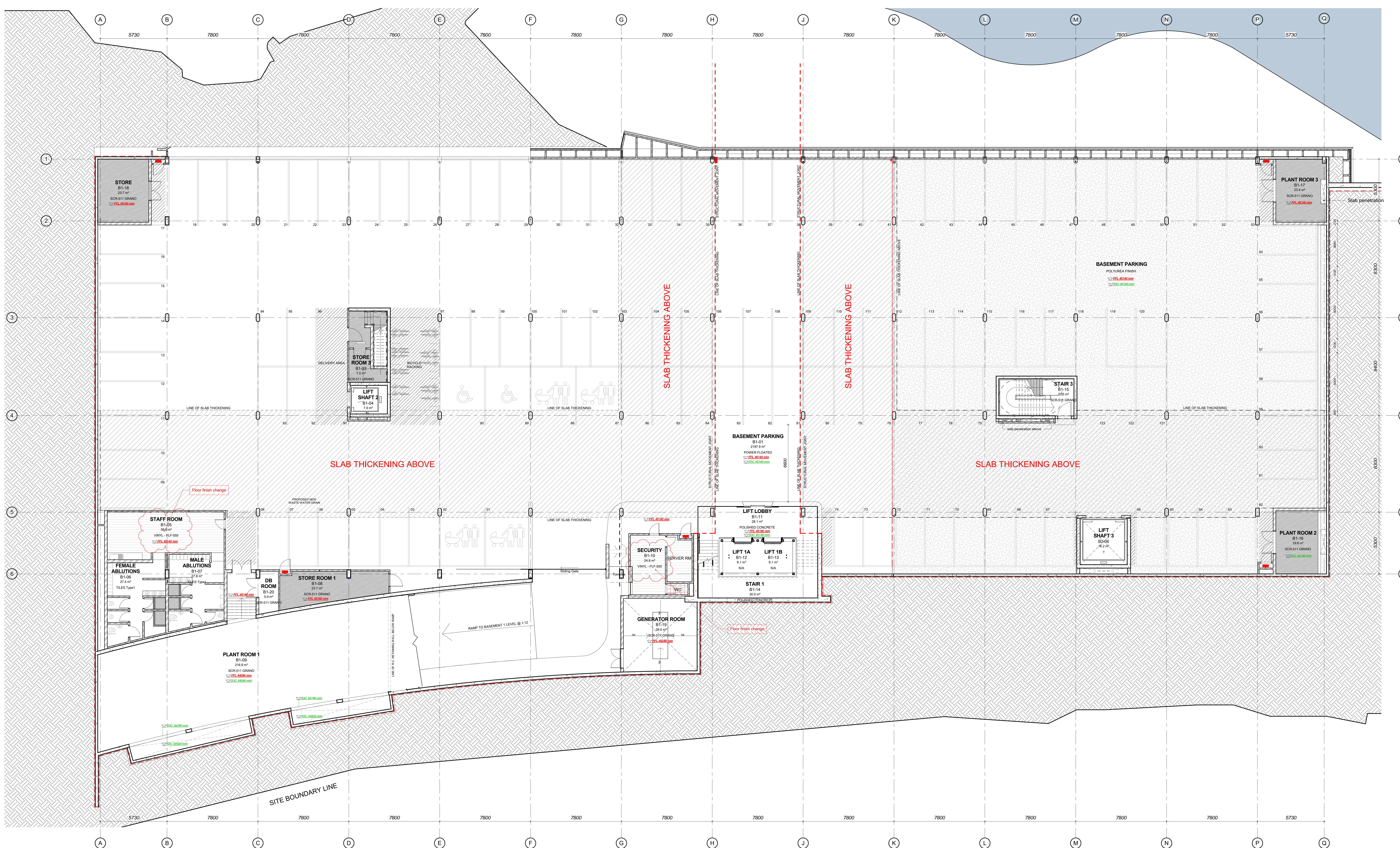
BASEMENT 1: Reference Plan